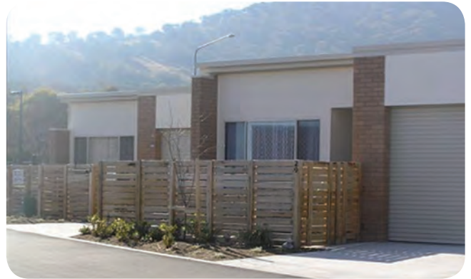
The Condor Complex on a sunny winter morning